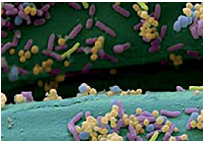
Electron microscope image shows several pathogens common in wounds, including Pseudomonas aeruginosa , Staphylococcus aureus and Candida albicans , all bound to the unique Sorbact fabric.

We are very excited about our new Sorbact range. Now you have an alternative, natural process of wound dressing that binds and inactivates pathogenic microorganisms, thereby reducing the microbial load in open wounds. This leads to the possible reduction in the use of antibiotics and the delivery of major benefits to your patients and staff.